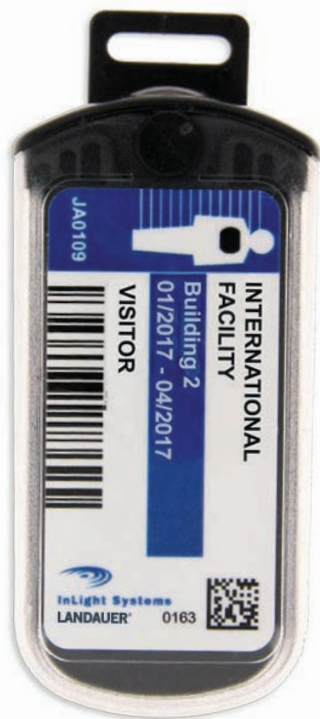
LANDAUER Holder Design