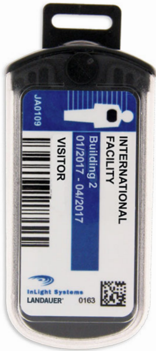
LANDAUER Holder Design