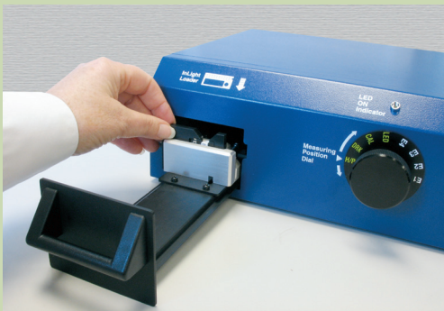
Loading an adapter with a dot carrier into a microStar Reader is easy!