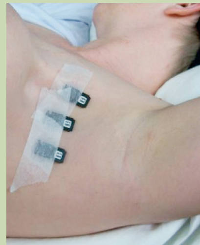
Example of patient dose application.